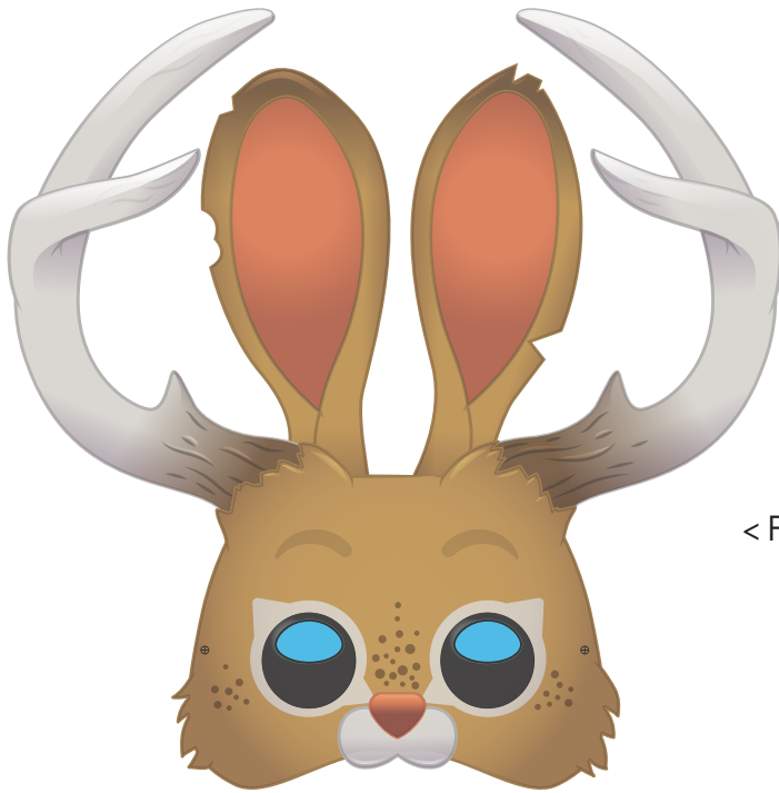
< Final mask look