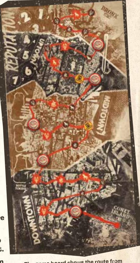
The game board shows the route from Van Cortlandt Park to Coney Island, separated into four neighborhoods: Bronx, Uptown, Midtown, and Downtown.